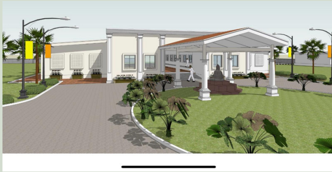
SSS Karunyaniketanam, TUMKUR