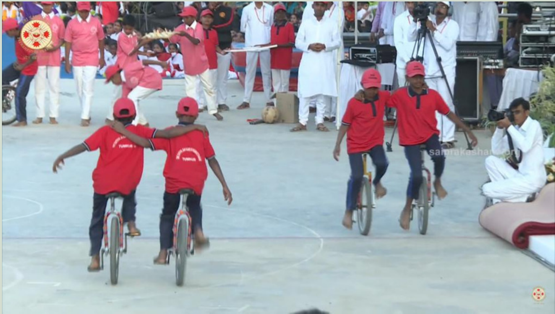
Bend The Body Skillful 6th Graders in the Sports Meet